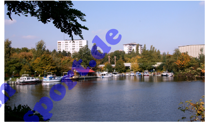
Hafen des MRC Berlin e.V. Harbour of MRC Berlin e.V.