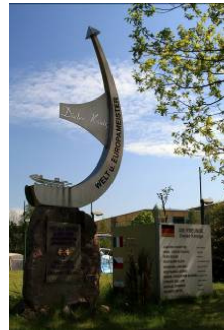
Denkmal für Dieter König Monument to Dieter König