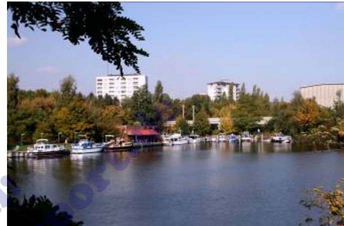
Hafen des MRC Berlin e.V. Harbour of MRC Berlin e.V.